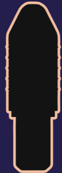
Bullet Head for All Body Parts